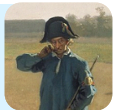
The Gleaners by Jules Breton