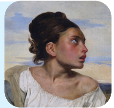
Orphan Girl at the Cemetery by Eugène Delacroix