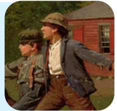
Snap the Whip by Winslow Homer