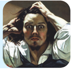
The Desperate Man by Gustave Courbet