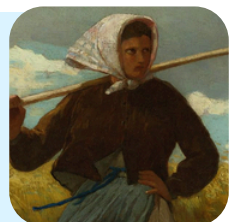
Return of the Gleaner by Winslow Homer